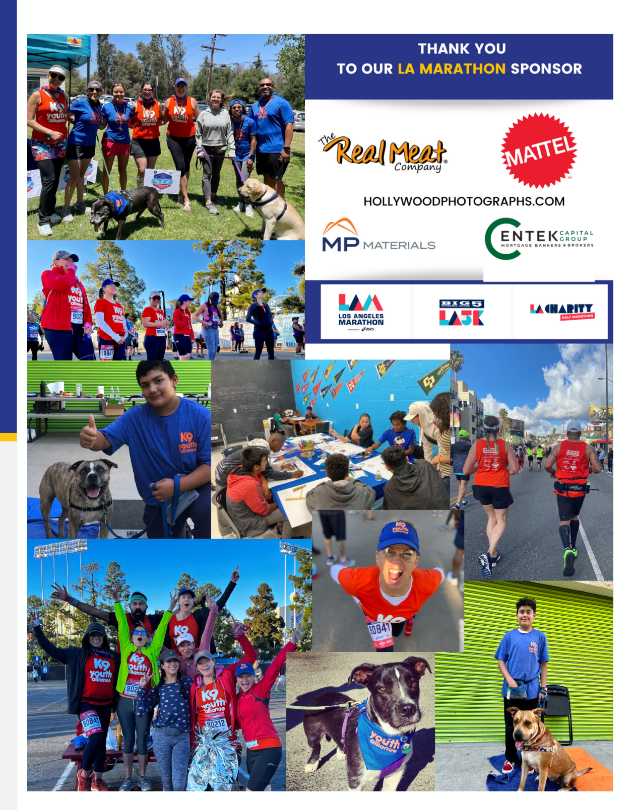
Thank You for the Consideration!